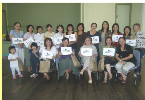
Vietnamese participants who have completed the sessions in Inala