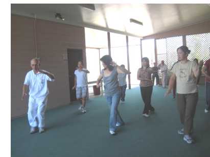
A tai chi group session